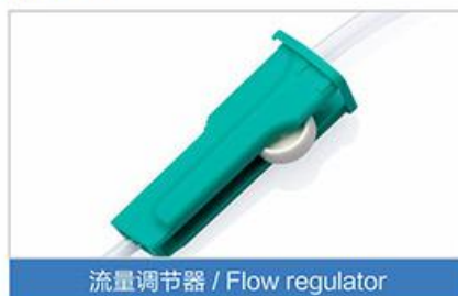
流量调节器 / Flow regulator