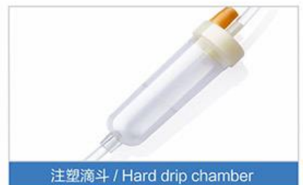
注塑滴斗 / Hard drip chamber